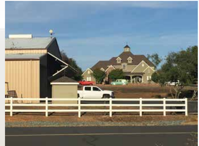
Neighboring estate home with aircraft hanger and taxiway in foreground