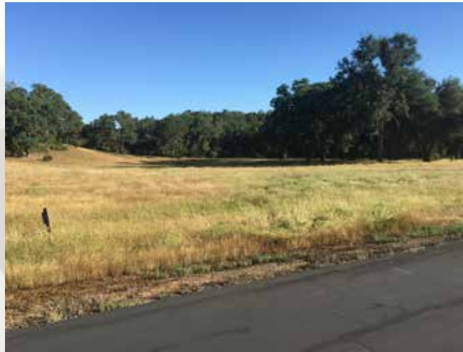
Lot 3 - ±25.34 Acres with meadow, oak woodland & taxiway/vehicular access in foreground