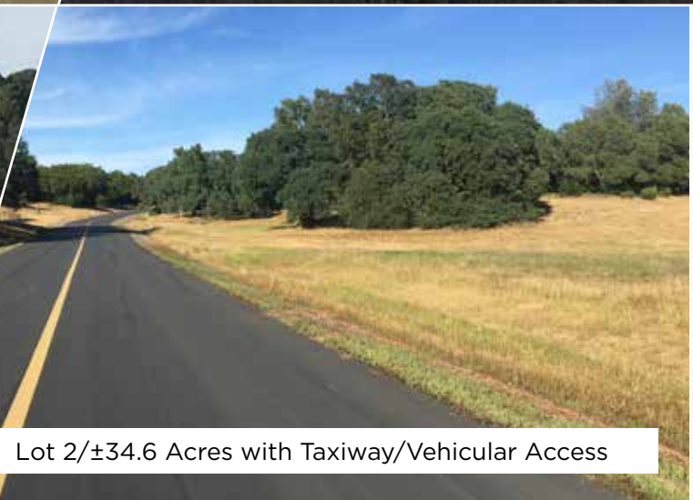
Lot 2/±34.6 Acres with Taxiway/Vehicular Access

KEN NOACK, JR. 916.747.6442 knoack@ngkf.com CA License #00777705