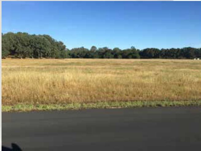
Lot 2 - ±34.6 Acres with meadow, oak woodland & taxiway/vehicular access in foreground

NEC Lambert Road & Eagles Ranch Road, Ione, Amador County, California