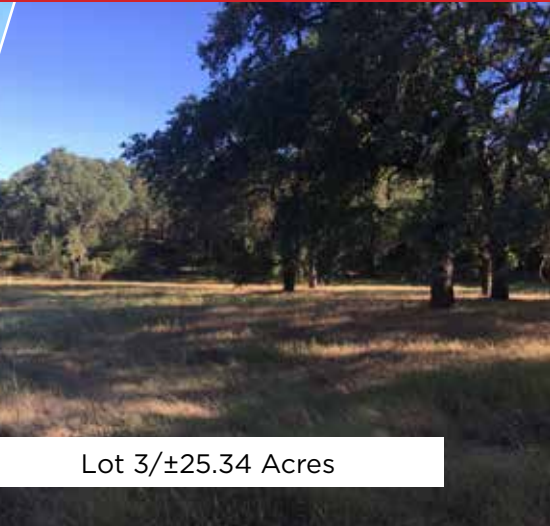
Lot 3/±25.34 Acres