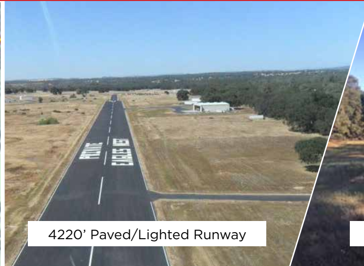
4220' Paved/Lighted Runway