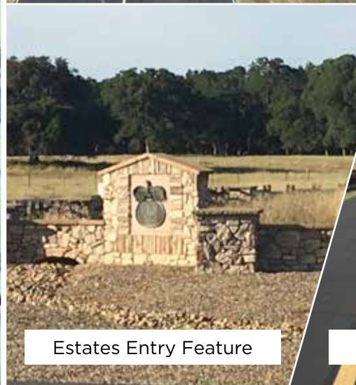
Estates Entry Feature